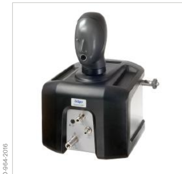
Dräger Quaestor 5000

All static and dynamic tests of the Dräger Quaestor 5000 take place semi-automatically as a sophisticated combination of personal handling and automated control during the test sequence. The newly developed software supports the user with intuitive user guidance.