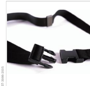
Dräger Saver Waistbelt