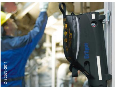
Dräger Saver CF hard case

Equipment Directive, the Pressure Equipment Directive and ISO 23269-1:2008 and ISO 23269-4:2011. Antistatic versions are also suitable for use in explosive atmospheres (ATEX zone 0).