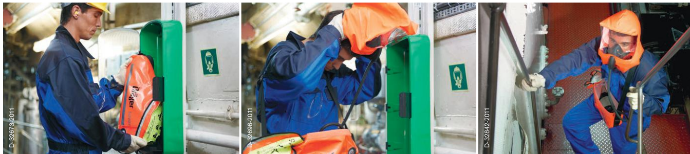
Dräger Saver CF soft bag