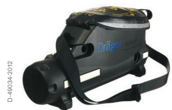
Dräger Saver CF – soft bag