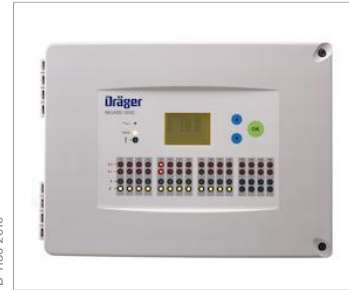
Dräger REGARD® 3910